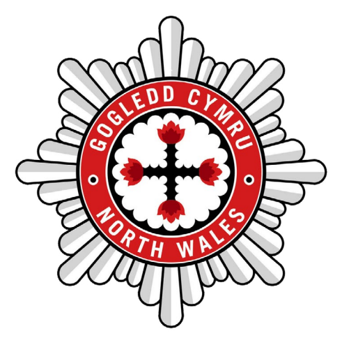
Gwasanaeth Tân ac Achub Fire and Rescue Service